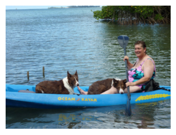
Ok, so maybe this was really just for fun. We WERE on a project in Hawaii' though!