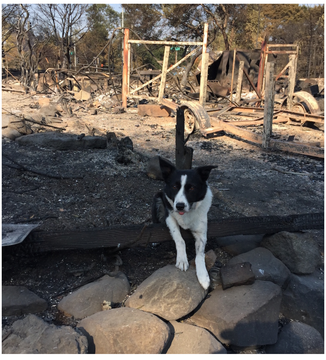
A Ray of Sunshine on a Cloudy Day

ICF is a non-profit organization in Northern California for the advancement of research and education of Forensic Evidence and Human Remains Detection Dog teams.