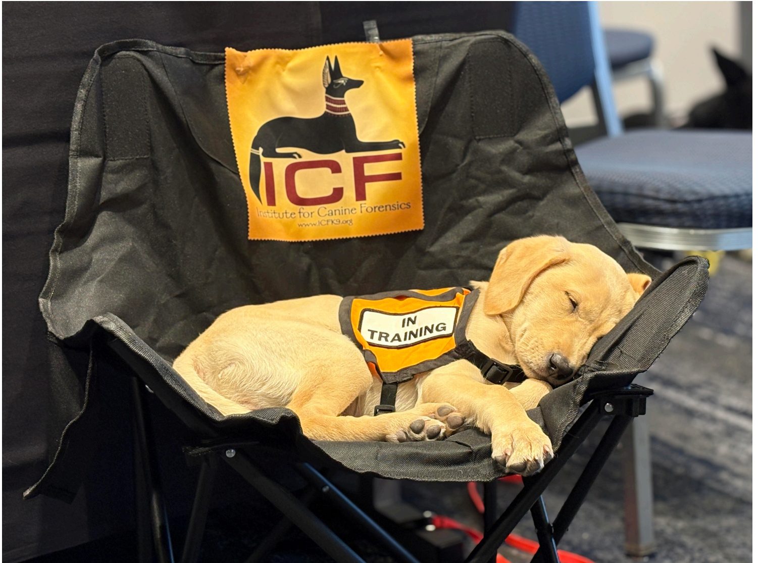
Charlie's debuted at the SCA Annual Meeting; she visited with many new friends and then had to nap.

feel strongly that people should not get a working breed unless they plan on giving that dog an active lifestyle for life. There are many activities and sports that dogs love.