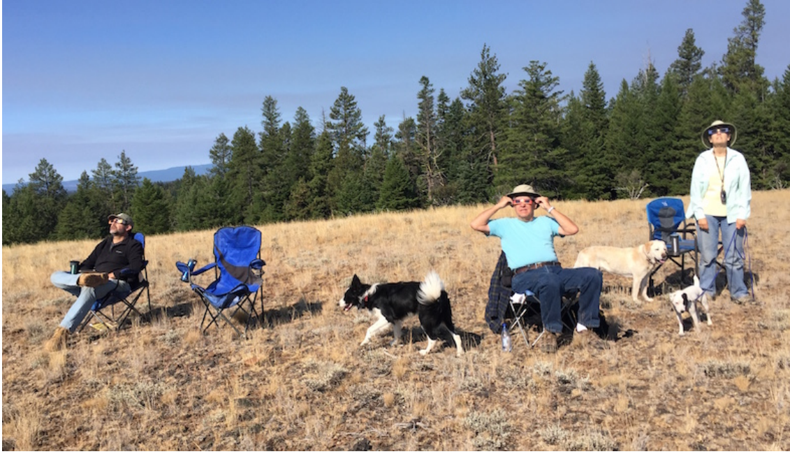
Waiting for the eclipse on our mountain top ridge.