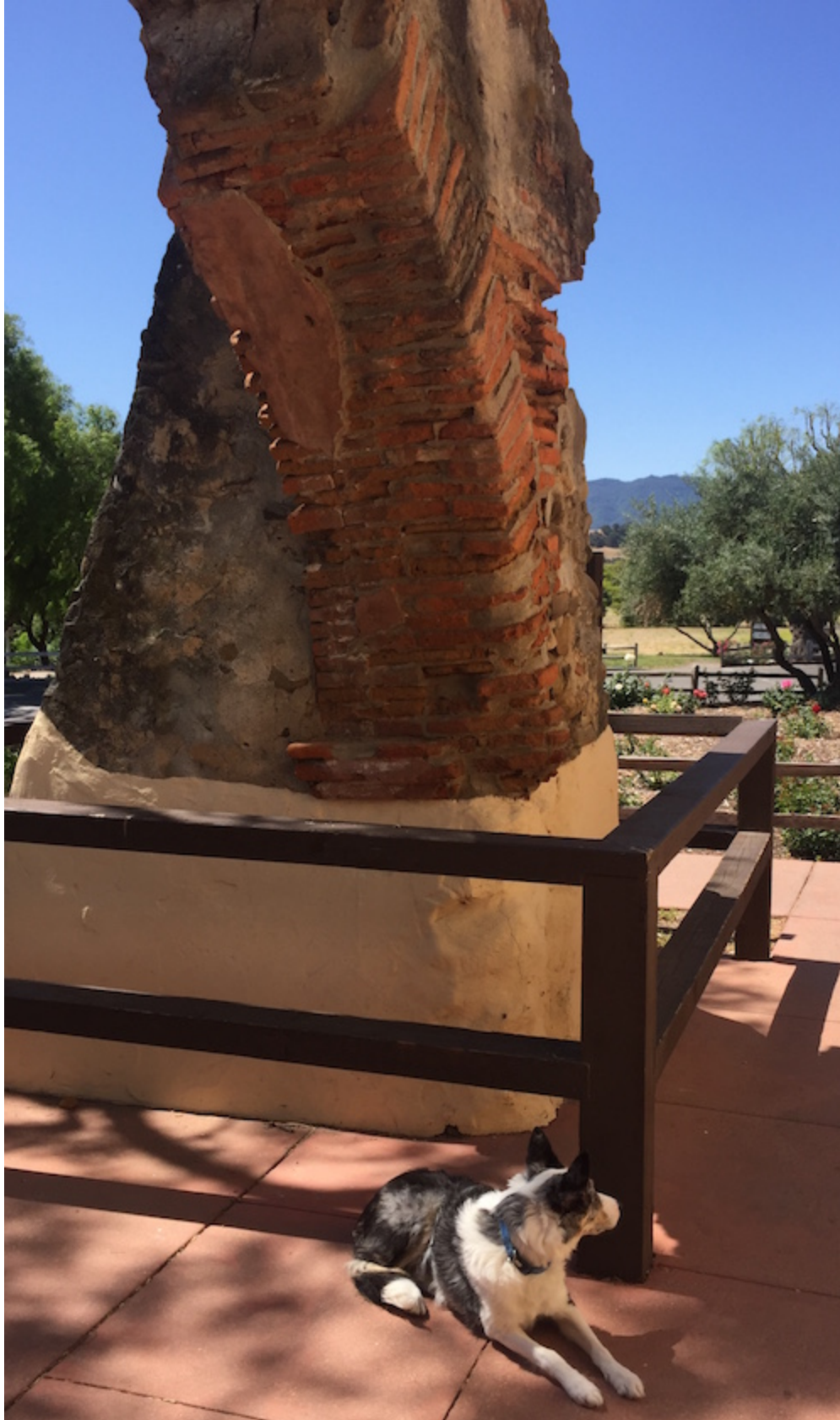
Jasper alerts at the broken arch.

You can check out past ICF newsletters on our web page.